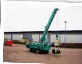
Pick and Carry