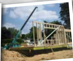
Timber Frame Work